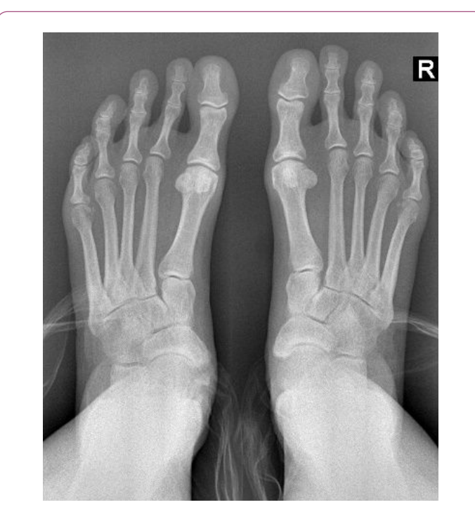
Figure 1: Bilateral metatarsal dislocation with deformities that end on 4th stage Crossover second toe syndrome. There is a visible valgus formation on R foot and arthritic process at metatarsal-phalangeal joint bilaterally. This type of condition and deformity is often associated with hallux valgus, hallux rigidus, a hammertoe, or a neuroma. The peak incidence is among women older than 50 years of age.

movements, flexion, extension and rotation were assessed. During the assessment, the specificity of pain, including quality, radiation, timing, and aggravating factors were evaluated as well. In addition, the patient also pointed out the most painful area and indicated where the pain radiates from during walking.