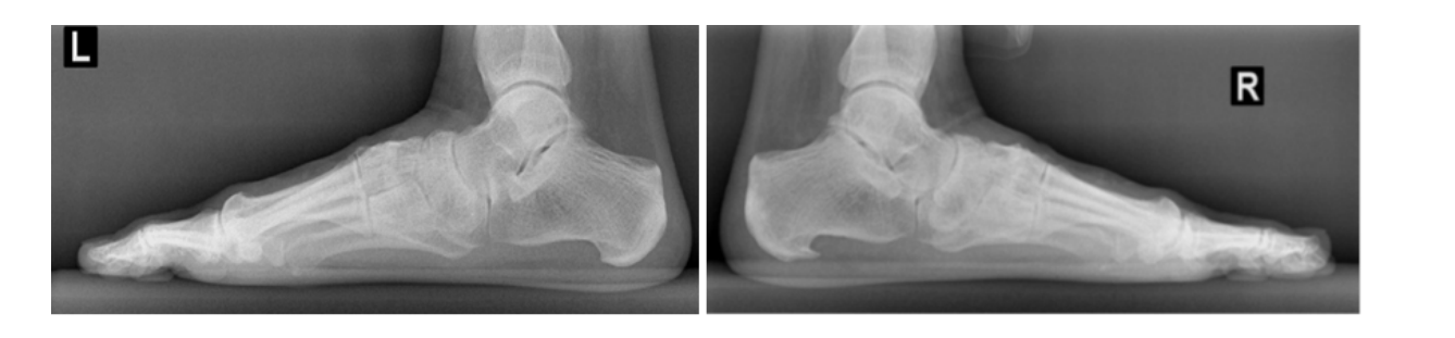
Figure 2: Arthritis can affect any joint in the body. This X-ray shows the presence of arthritic process on main foot junctures.