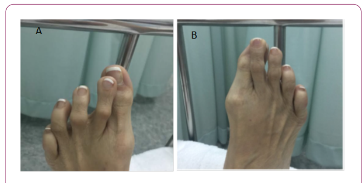
Figure 3: The presence of crossover second toe deformity on both A) left and B) right feet. The condition is a derivation of multiple factors locally and distally. Locally there is a lack of compensatory forces derived from the different tendons of the area, which consequently causes a gradual degenerative arthritic process that eventually erode cartilage, bone and damages tendons; distally, the main issue is due to a degeneration of the ankle and knee structure that causes a deviation of the correct posture, determining a deviant force pressure on the feet.

Telomere analysis by RT-PCR CFX 96 (Biorad) has been performed at that time and the results showed normal activity of telomerase and long telomere inside cells: 12.5 Kb/ chromosome and 287.5 Kb/cells that increased after the treatment to 16.3 Kb and 376.8 (normal range 1.70 to 24.83 kb).